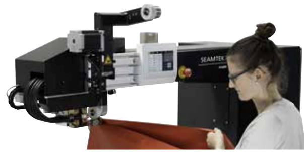
New, innovative welding wedge solution.