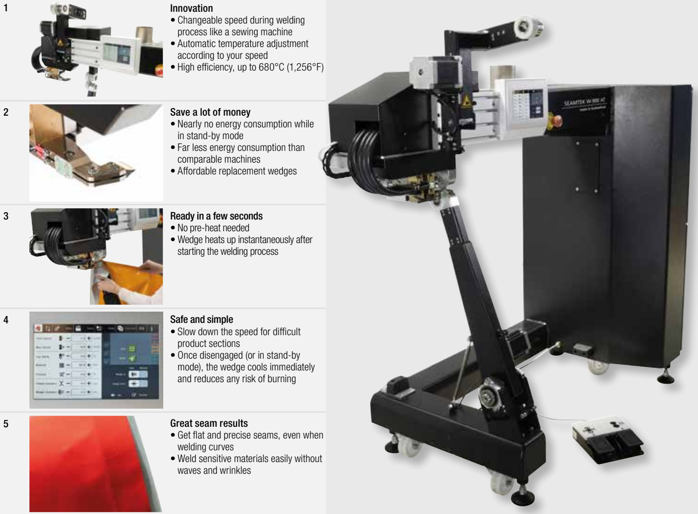
Leister SEAMTEK W-900 AT

Based on the proven SEAMTEK W-900AT is this the first machine worldwide with this new and innovative low voltage wedge technology. With the genuine innovation of variable speed during welding process, this machine will change your welding experience. Weld the best possible, highest quality seams. Meet the world champion in efficiency.