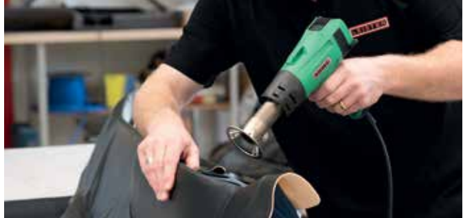
SOLANO AT - Difficult leather parts - safe and efficient processing